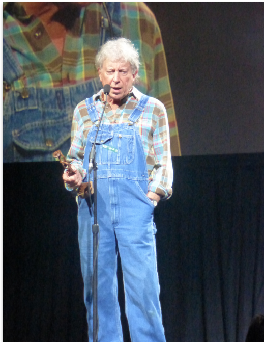
Elvin Bishop: Band of the Year, Album of the Year, Song of the Year

you to make it happen. I know I don't plan to miss them from here on