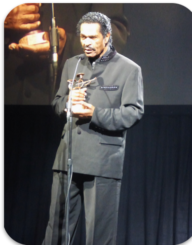
B.B. King Entertainer of the Year Bobby Rush