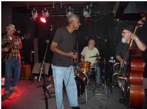
The Little Kings