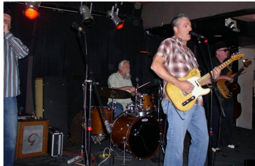
Chickenbone Slim & The Biscuits